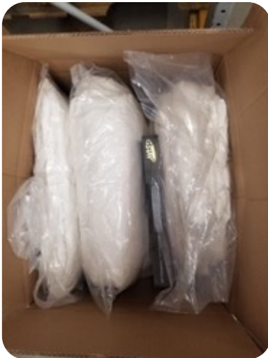
King Orange Box 1

King Mattress Encasement, King Mattress Protector, (2) STD Pillows, (2) KG Pillows, (2) STD Pillow Protect/Bedding/HPPQ (2) KG Pillow Protect, Guest Rm Phone, Cordless Phone/Guest Rm/A242SDU, Steam Iron, Ironing Board Cover