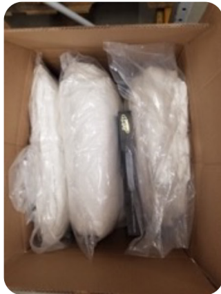
Full Yellow Box 1 & 2

(8) STD/QN Pillows, (8) STD/QN Pillow Protectors, Weighting Scale, Hook for Weighting Scale, Hair Dryer, Guestroom Phone, Cordless Phone, Steam Iron, Iron Board Cover