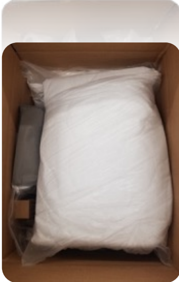
Full Red Box 3