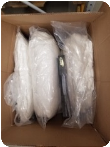
Queen Pink Box 1

Queen Mattress Encasement, Queen Mattress Protector, (2) STD Pillows, (2) KG Pillows, (2) STD Pillow Protector, (2) KG Pillow Protector, Hair Dryer, Guestroom Phone, Cordless Phone, Steam Iron, Iron Board Cover