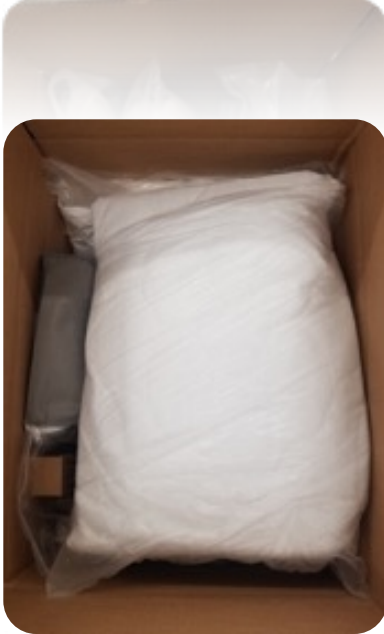
Queen White Box 2