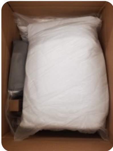
King Orange Box 2